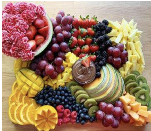
Rainbow Platter $275