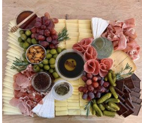
Oak Board $410