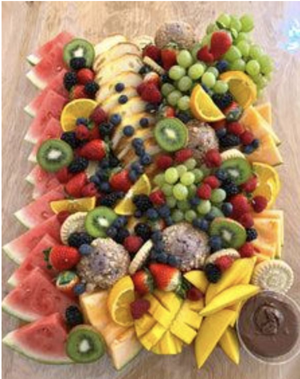
Blossom Board $355

Includes: watermelon, cantaloupe, strawberries, mango, blackberries, raspberries, blueberries, kiwi, orange, pineapple, grapes, flowers and Nutella.