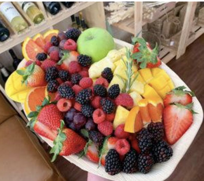
Tropical Fruit Tray $190