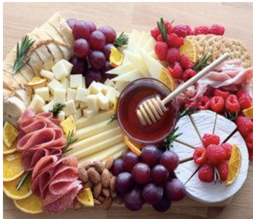
Aromatic Board $270