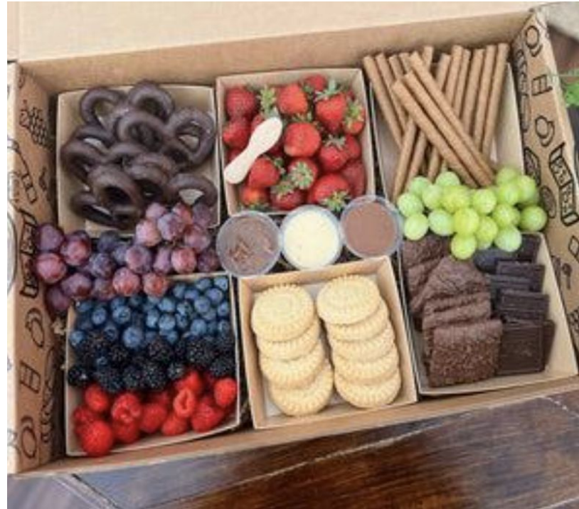
Dessert Box (Medium size feeds 8-10pp) $235

Includes: Nutella, cakes, chocolate chips cookies, chocolate bar, grapes, raspberries, strawberries, & chocolate almonds.