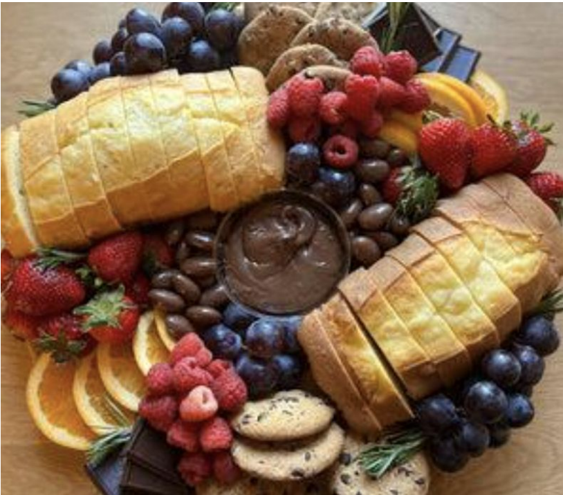
Sweet Birthday Board (Medium size feeds 8-10pp) $315

Includes: Nutella, cakes, chocolate chips cookies, chocolate bar, grapes, raspberries, strawberries, & chocolate almonds.