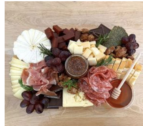
Simplicity Board $290

Includes: bread baguette, honey, brie, Manchego, parmesan, gruyere, salami, prosciutto, crackers, raspberries, grapes, oranges & almonds