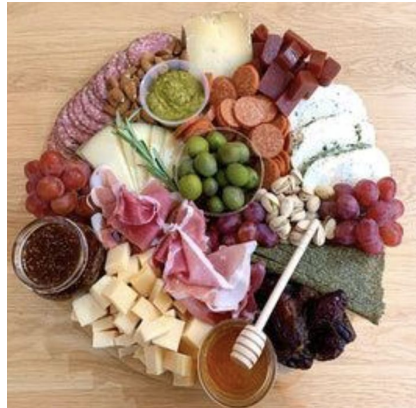
Forest Board $390