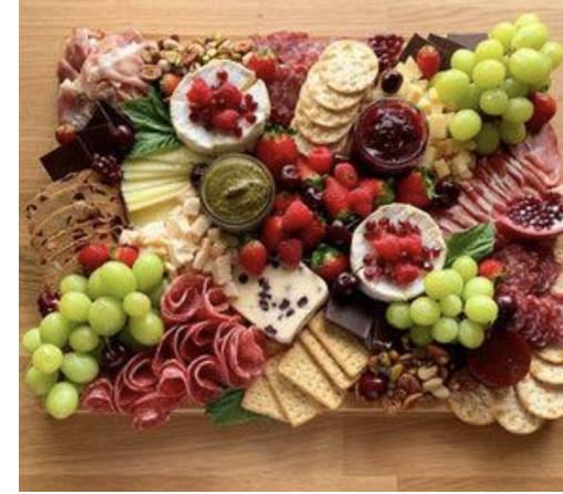
Deluxe Board $410

Includes: Manchego, gruyere, gouda, brie, prosciutto, serrano, salami, cornichons, olives, grapes, chocolate bar, honey, basil pesto, almonds, oil and vinegar with spices.